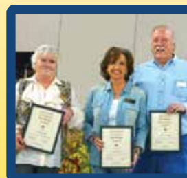
Training to become a CASA takes approximately thirty hours. The time necessary to complete the duties on an individual case is ten to fifteen hours per month. To be a CASA is to be the "eyes and ears of the court" on behalf of a child.